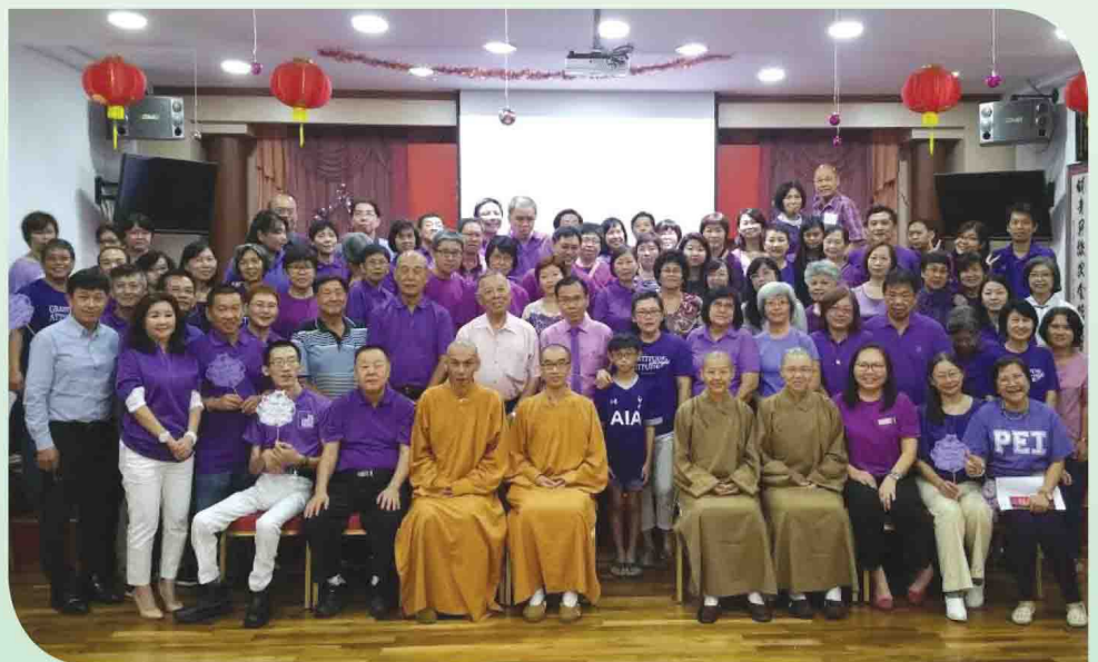
Volunteer Appreciation Purple Party ~ December 2016 感恩义工派对