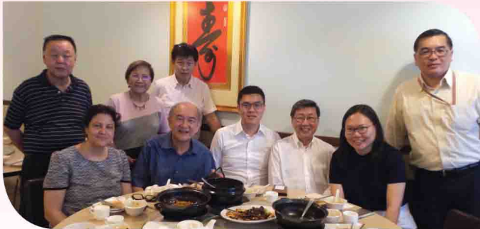
▲ Celebrating similarities with friends from Bahai Community of Singapore ~ June 2017 与巴哈伊社区的朋友共勉，不亦乐乎？