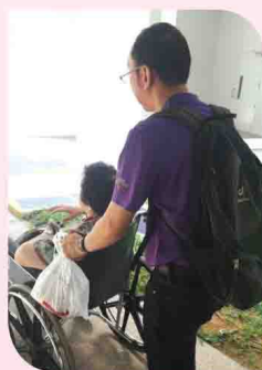
Medical escorts - a joyless task makes joyful under the care of a dedicated kaki 陪同年长者复诊

透由我们用心的工作人员和志愿者，福善继续把我们的爱与关怀传递于老人家。感谢我们有机会给与老人家一点欢乐，在他们生命的最后一端陪伴他们，不让他们独自一人。