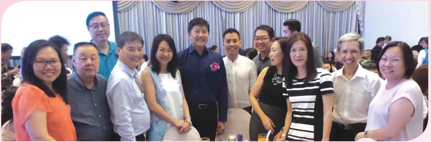
▲ Promoting sharing, serving, giving and receiving by Realm of Tranquillity since 1978 ~ August 2017 学习清一阁所提倡“为善最乐”，“促进社会责任”的精神。