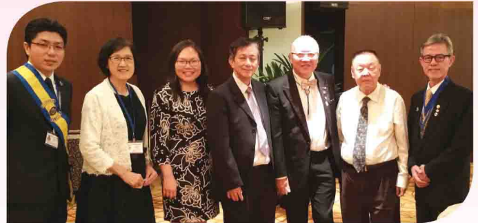
▲ Meeting the family of Rotarians who are committed to place Service Above Self ~ June 2017 认识罗马尼亚“服务至上”的精神。