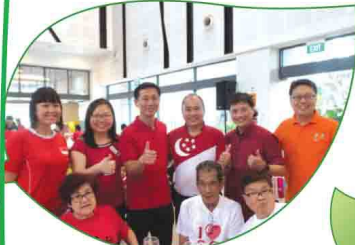
Gardens to Plate 从菜园到餐盘