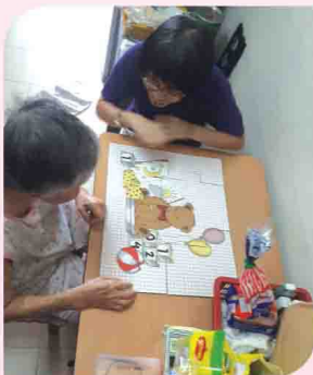
Mind-stimulating Exercises ~ simple joy of accomplishment 脑保健活动