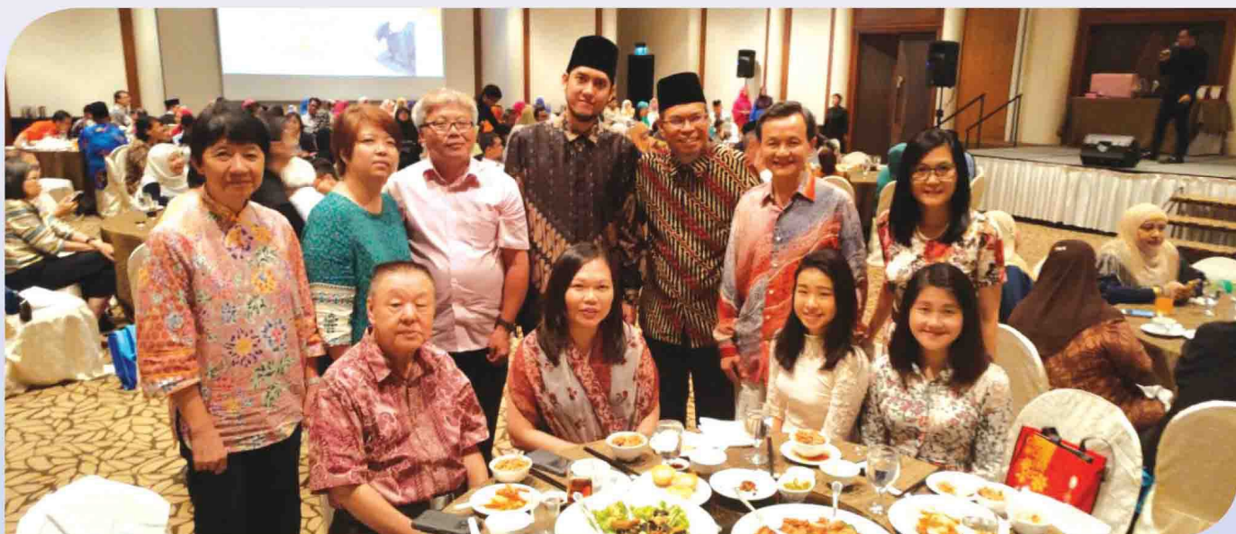
▲ An-Nahdhab Mosque 10th Year Anniversary Dinner ~ January 2017 安纳达回教堂十周年晚宴