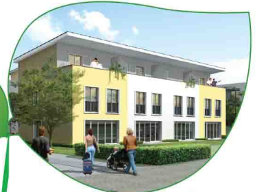
Sheltered Home* 年长者的庇护所