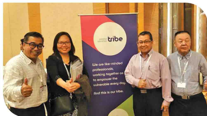
▲ Social Service Summit 2017 to discuss progress and actions towards a future ready sector ~ July 2017 社会服务峰会讨论未来慈善团体的进展与方向