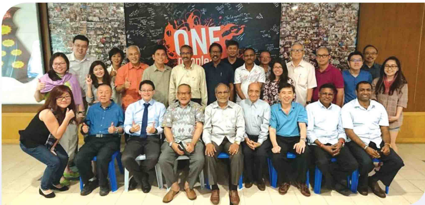
▲ Organised by IRCC to understanding the strengths and pitfalls of Social Media ~ August 2016 族群与宗教互信圈举办了解社交媒体的长处和弊端