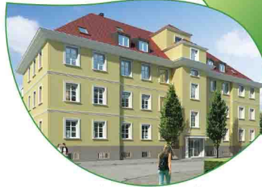
Nursing Home* 疗养院

Awarded IPC 公益机构 (Institutions of a Public Character) Status