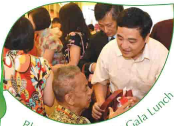
Blossom Love Charity Gala Lunch 爱心宴