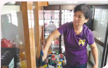
House Cleaning ~ A clean home is a happy home 居家清理