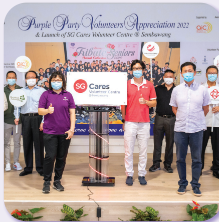
SG Cares Volunteer Centre @ Sembawang.