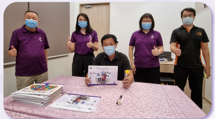
Blossom Seeds MET Service partners Agency for Integrated Care (AIC) since 2018.