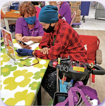
Digitalisation for Vulnerable Seniors.