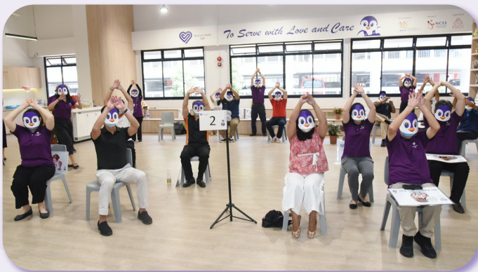
Penguin Dance of Unity

Digitalisation in action to bring connectivity to the vulnerable seniors.