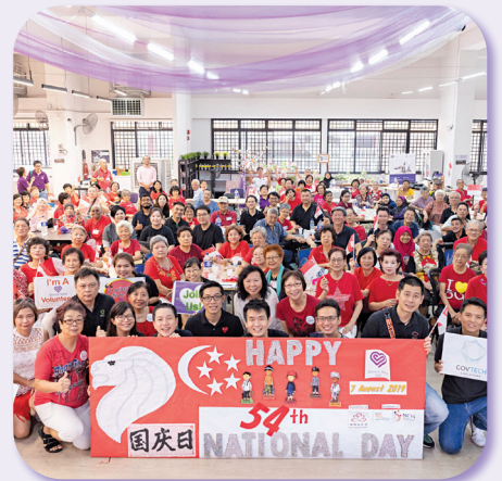
Active Ageing Centre for Active and Vulnerable Seniors.