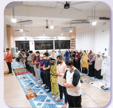
IFTAR Obervance to Promote Cultural Cohesion.