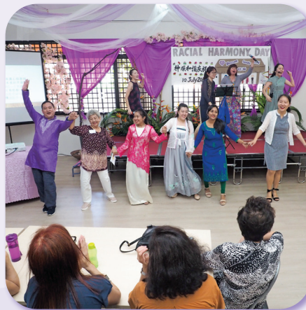
Racial Harmony Celebration Supported by MICRON.