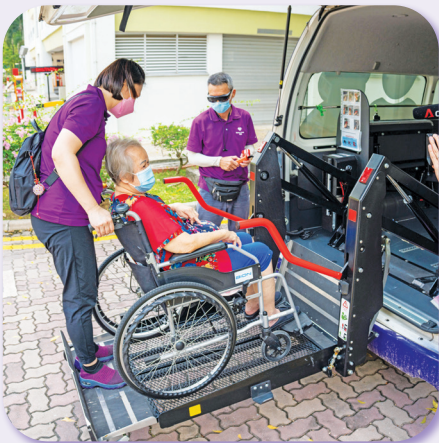
Medical Escort & Transport for Frail Seniors.