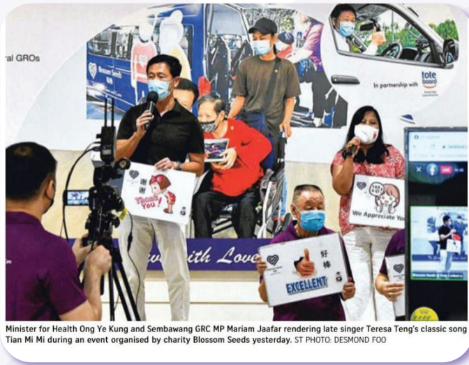
Tribute to the Healthcare Workers.