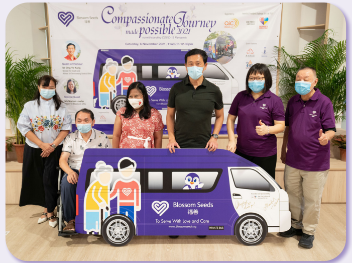
Sponsorship of 3 rd Wheelchair Enabled Bus.