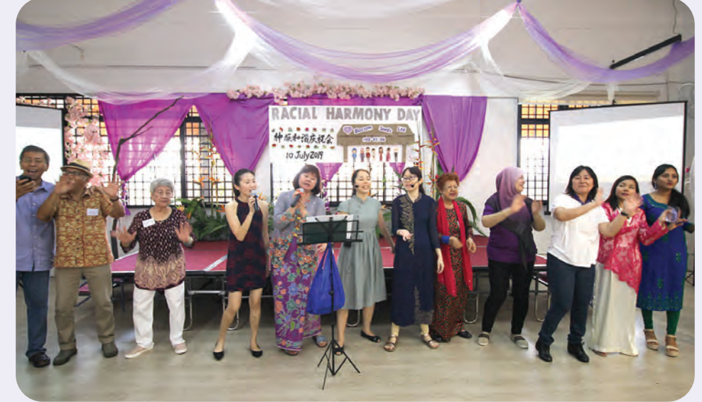
Micron Semiconductor Asia Pte Ltd United Indu