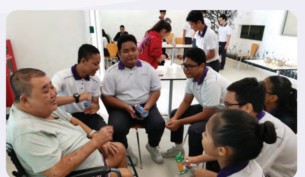
Spectra Secondary School