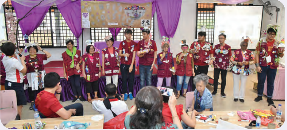
BP Singapore Pte Ltd