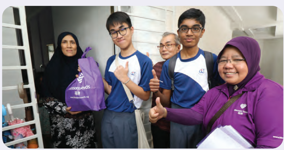
Canberra Secondary School