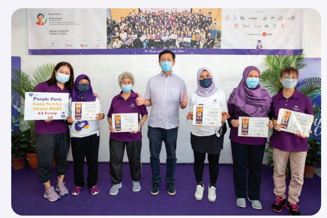
Long Service Award 2022 (Active Ageing)