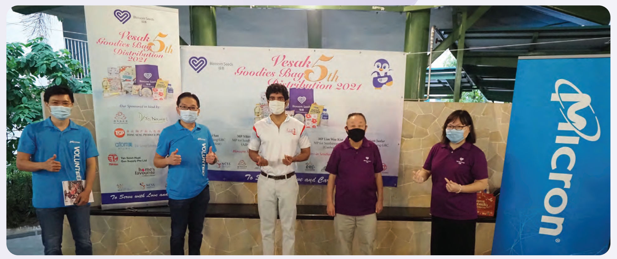
Micron Semiconductor Asia Pte Ltd