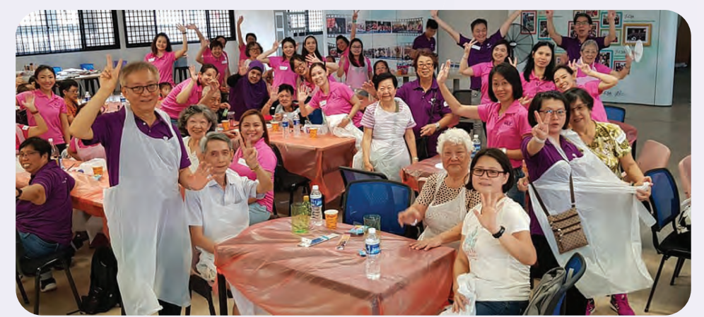
Digital Realty (Singapore)