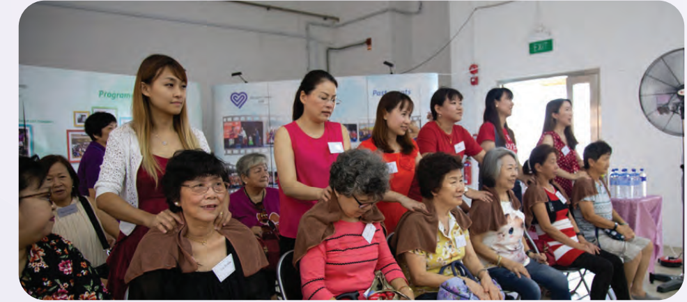
My Cozy Room