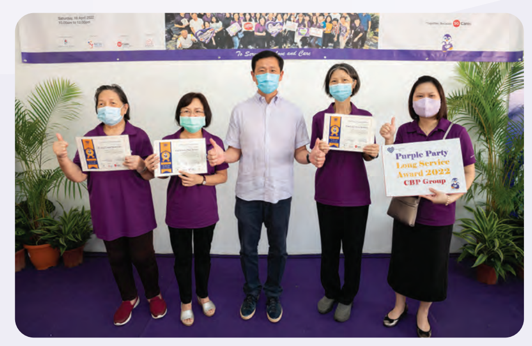
Long Service Award 2022 (Community Befriending Programme)